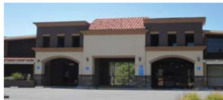
The new home of Outdoor Supply Hardware