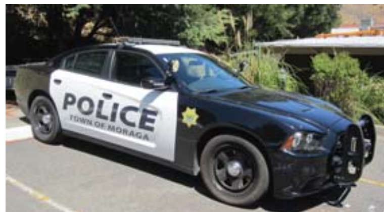
Moraga Police Department's Dodge Charger